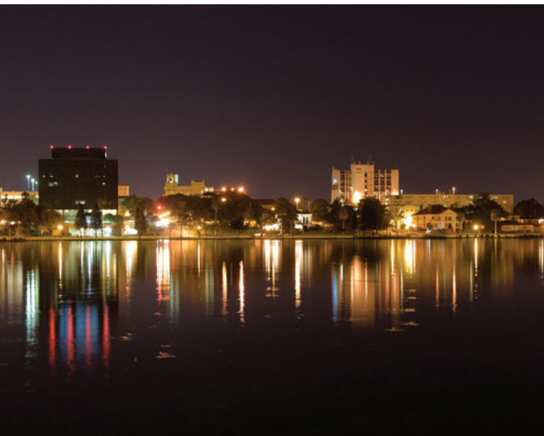
Lakeland at night

Located in the humid, subtropical heart of Florida, Lakeland Electric's transmission and distribution network regularly faces storm conditions ranging from typical thunderstorms to the most powerful tropical storms in the world. When inclement weather strikes their service territory, Lakeland must work quickly and safely to re-route or restore power to customers in very difficult situations.