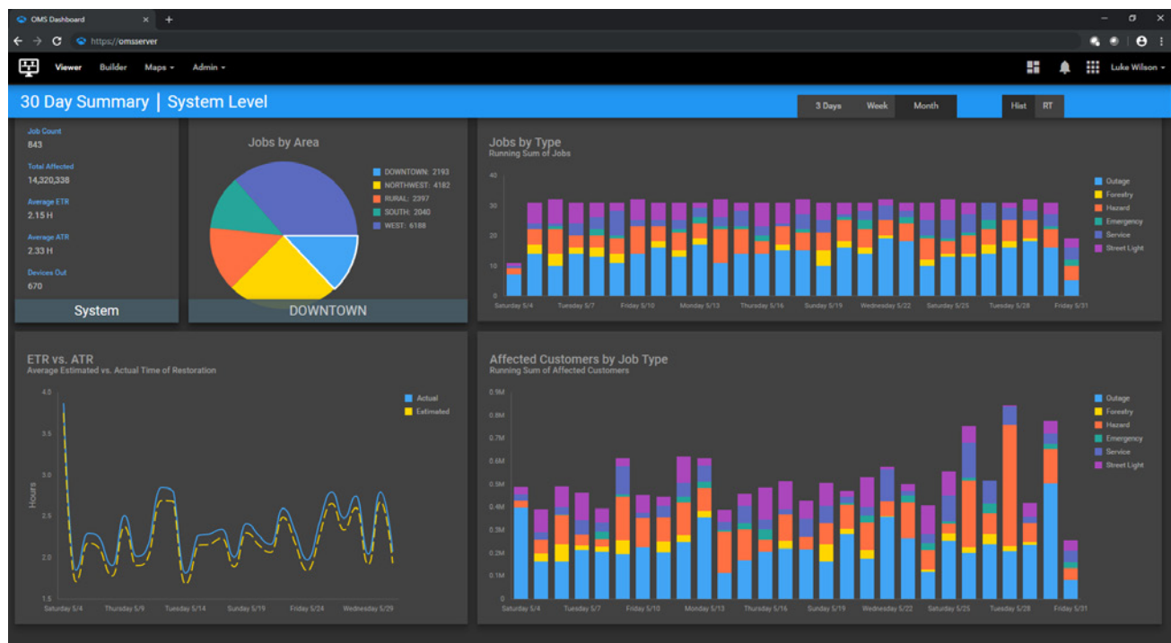
An OMS dashboard like that in use by Lakeland Electric